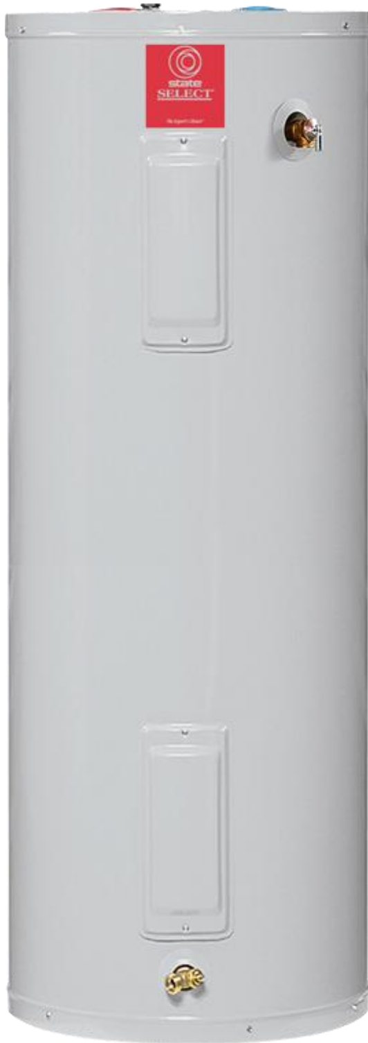
Tall Model - 66 Gallon