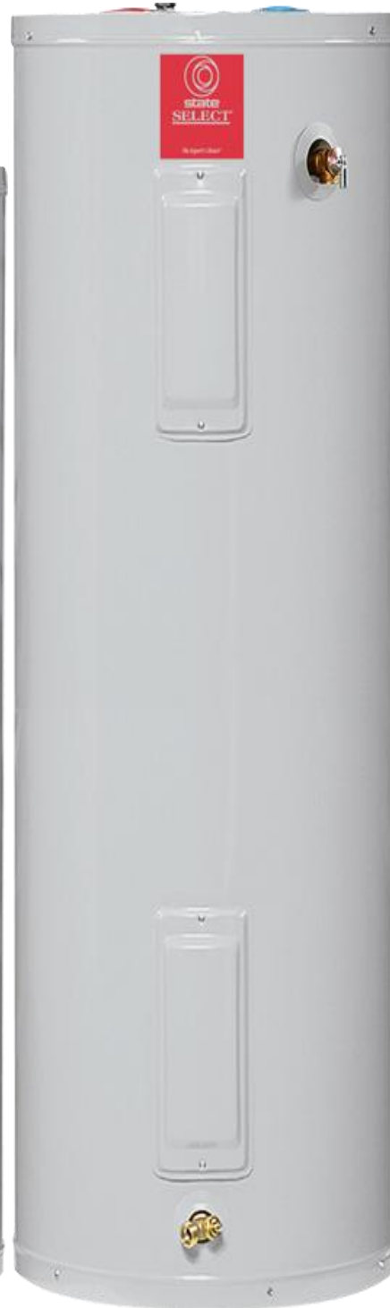
Tall Model - 40 Gallon