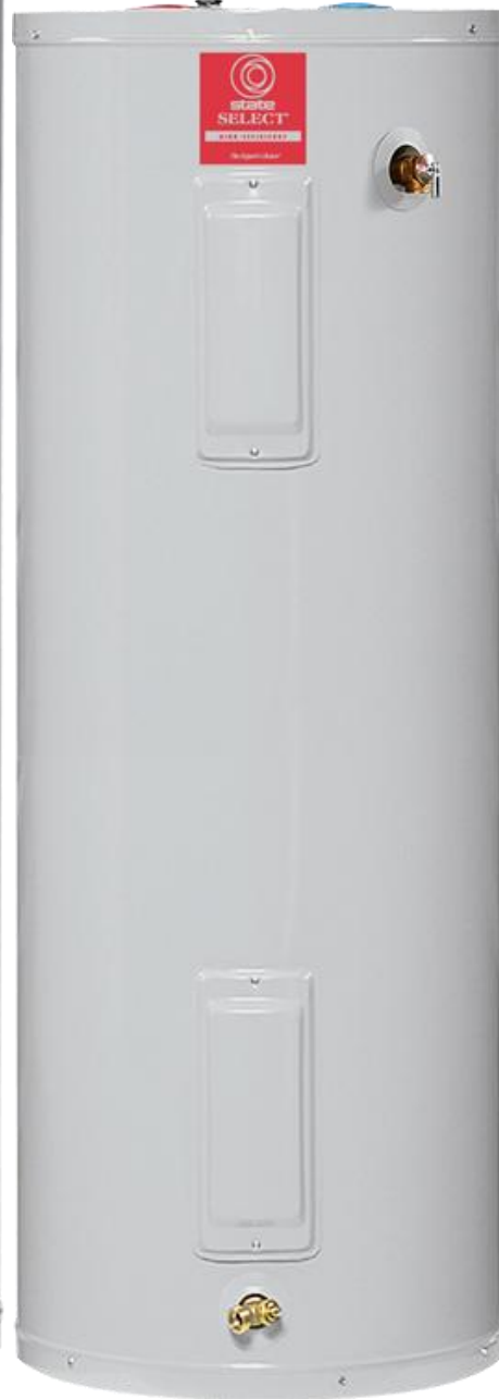
Tall Model - 52 Gallon