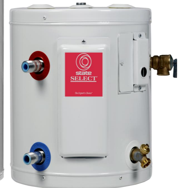
Junior Model - 20 Gallon