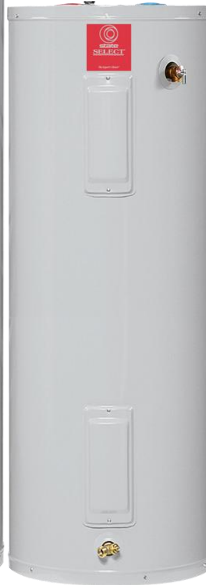
Tall Model - 30 Gallon