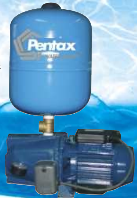
CAM 50 w/18L p/tank

Caution: Always use a float switch with a pressure tank to prevent your pump from running dry.